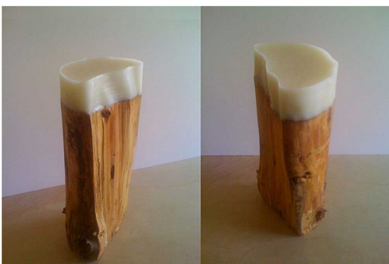
Touch the Wood and Smell the Wax. 2012. Beeswax and Wood H 22" x Diameter 10"