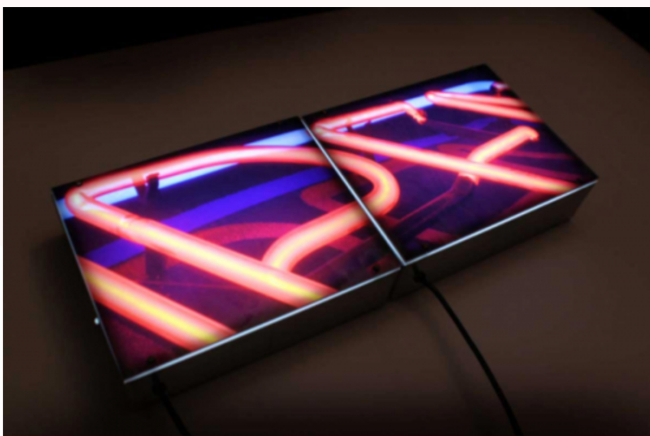
Open. 2012. Light Boxes. Two Duratrance Prints sandwiched between Plexiglass and backlit. H 10" x W 33" x D 3"