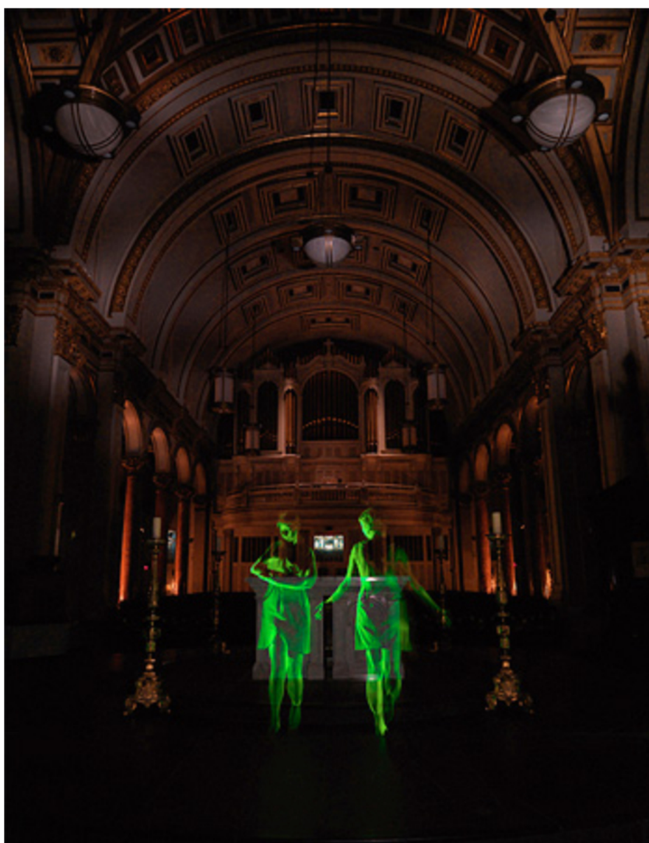
ACCEPTANCE AND VULNERABILITY. A luminous imprint of a person as captured by the plane of light inside St. James Cathedral. 50' W x 60' H. St. James Cathedral, Seattle. Photo: Iole Alessandrini