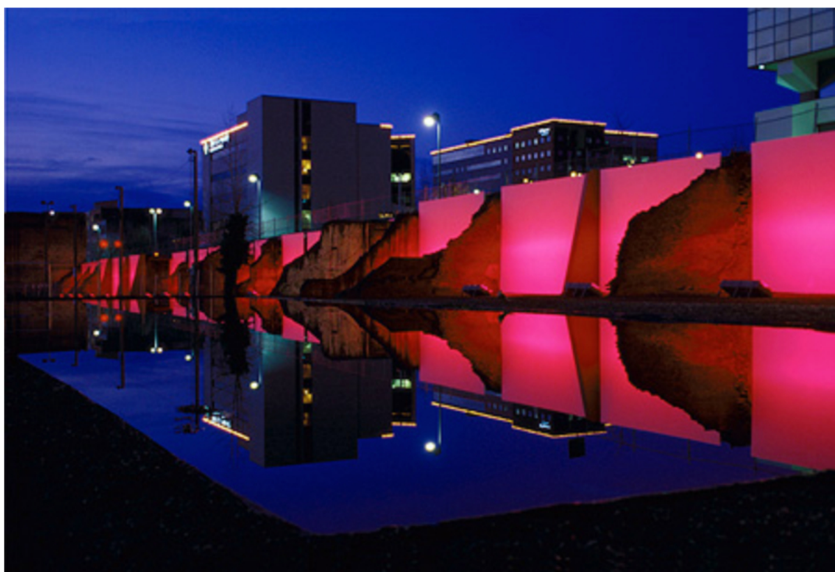
WINTER. SEASON OF LIGHT. 2000. Red fields of light are reflected upon the boundaries of architecture and water. 100' H x 700' W x 100' D (Two city blocks), Pacific Avenue, 1300 Block, Tacoma, WA.